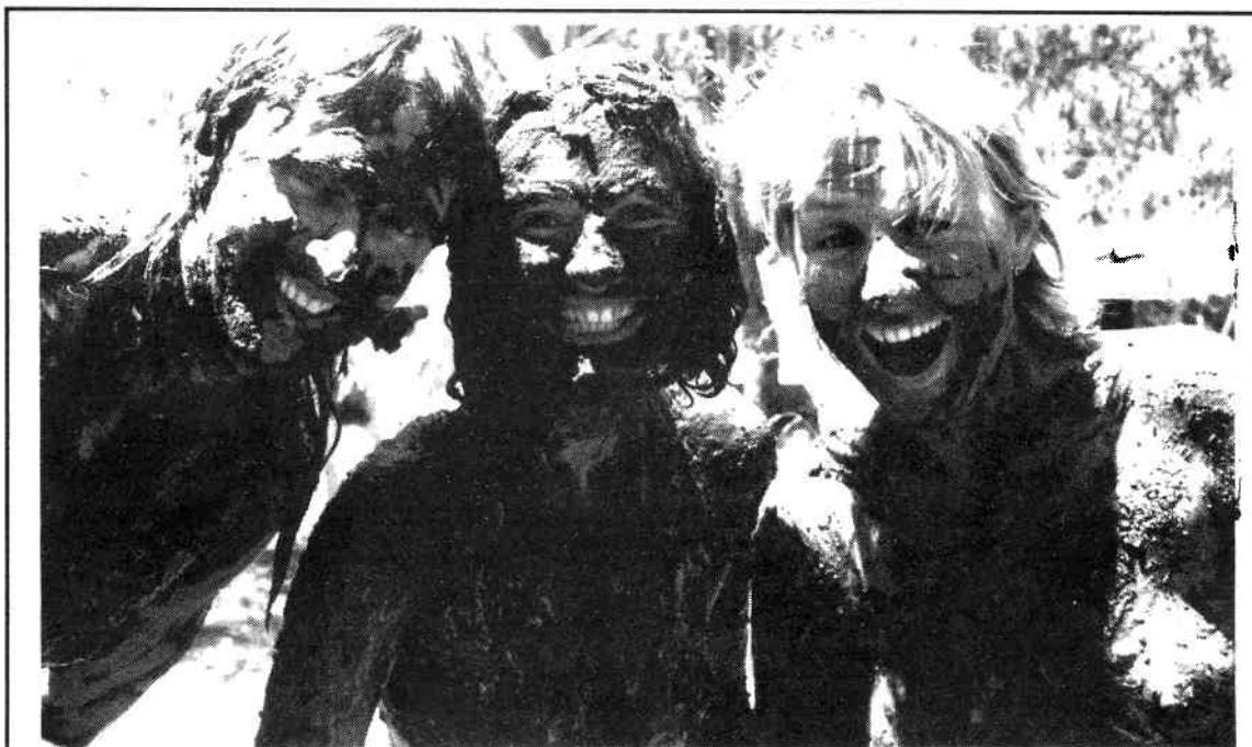
WALWA MUD PEOPLE.